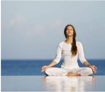
$$$ Fitness & Wellness Class