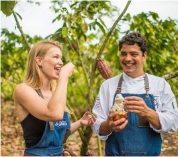
$$ Taste of Local Cuisine & Culture