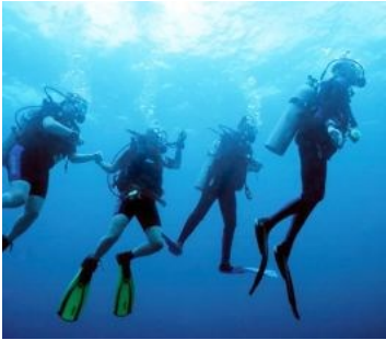
$$$ Scuba Diving