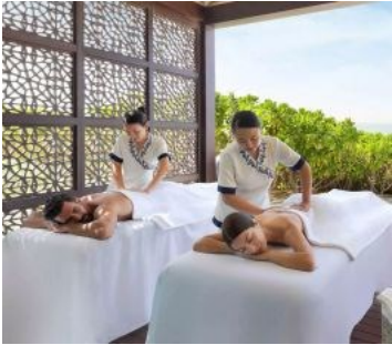
$$$ Spa Treatment