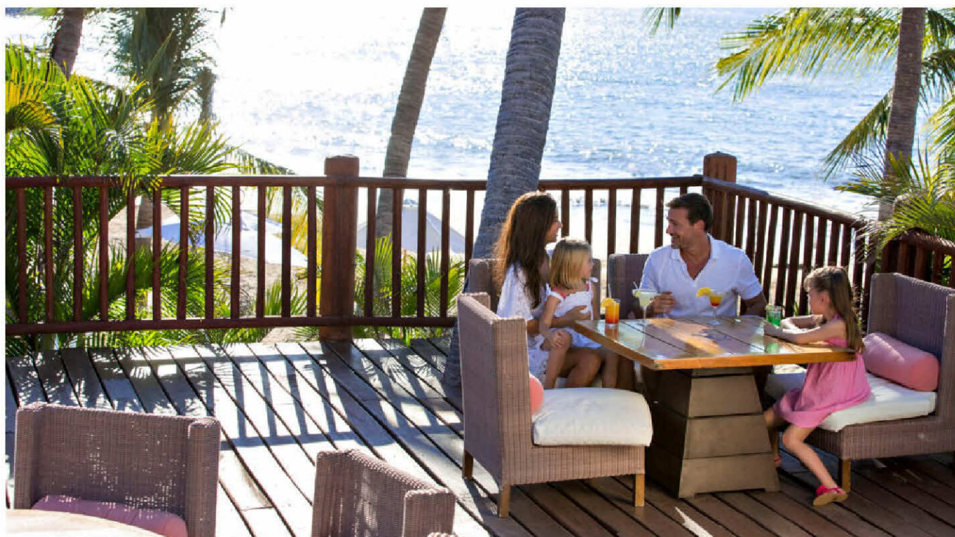
Enjoy ocean views while dining at Club Med Ixtapa.

Mealtimes in the two open-air restaurants are a treat. The main restaurant, El Encanto, serves an international breakfast, lunch and dinner buffet with made-to-order omelets. The terrace was recently renovated and is a great spot for a sunset dinner.