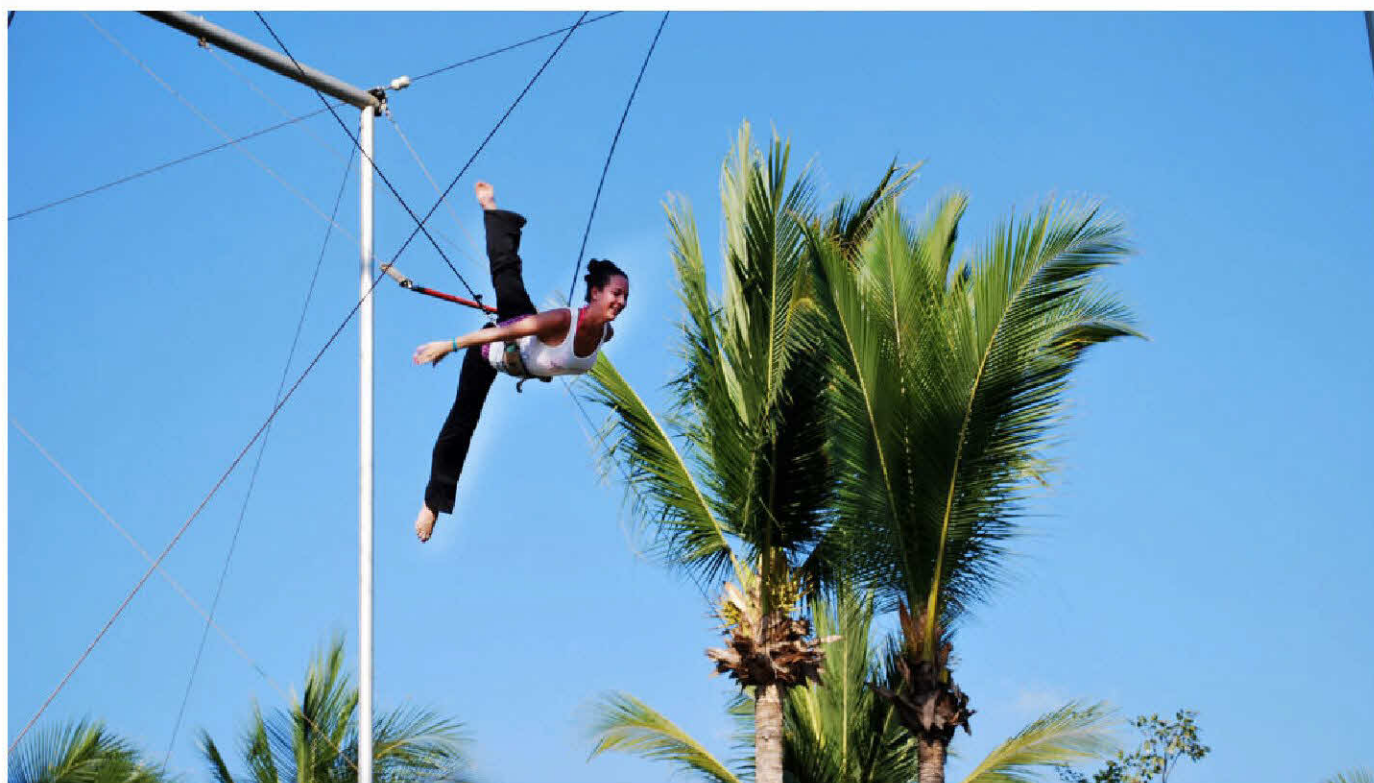
Club Med's signature Flying Trapeze is popular with kids and adults.

Club Med Ixtapa offers a nice mix of low-key and thrilling activities. It's where I learned to sail a Hobie Cat (a small water craft), and swing on a trapeze. Club Med Ixtapa's water sports include sailing, kayaking and swimming in the ocean or outdoor pools. The water aerobics classes are a fun way get exercise while staying cool. Shore activities include salsa dancing, fitness classes, yoga, Pilates, archery and tennis.