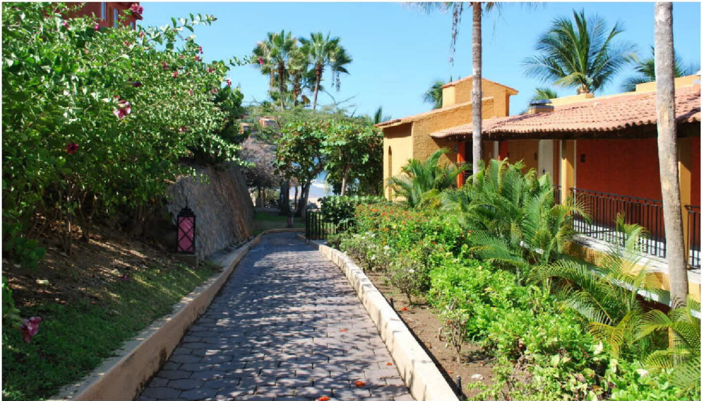
Cozy walkways meander through the property, leading to guest rooms and the beach.

Club Med Ixtapa features brightly colored, hacienda style rooms. Landscaped paths wind among the buildings and lead to the beach. During my visit, I stayed in the oceanfront suites in the Sol building. The luxury suites have a private deck, concierge services, breakfast room service, complimentary WiFi and direct beach access. The village also has comfortable family rooms with garden views but minus the personal services.