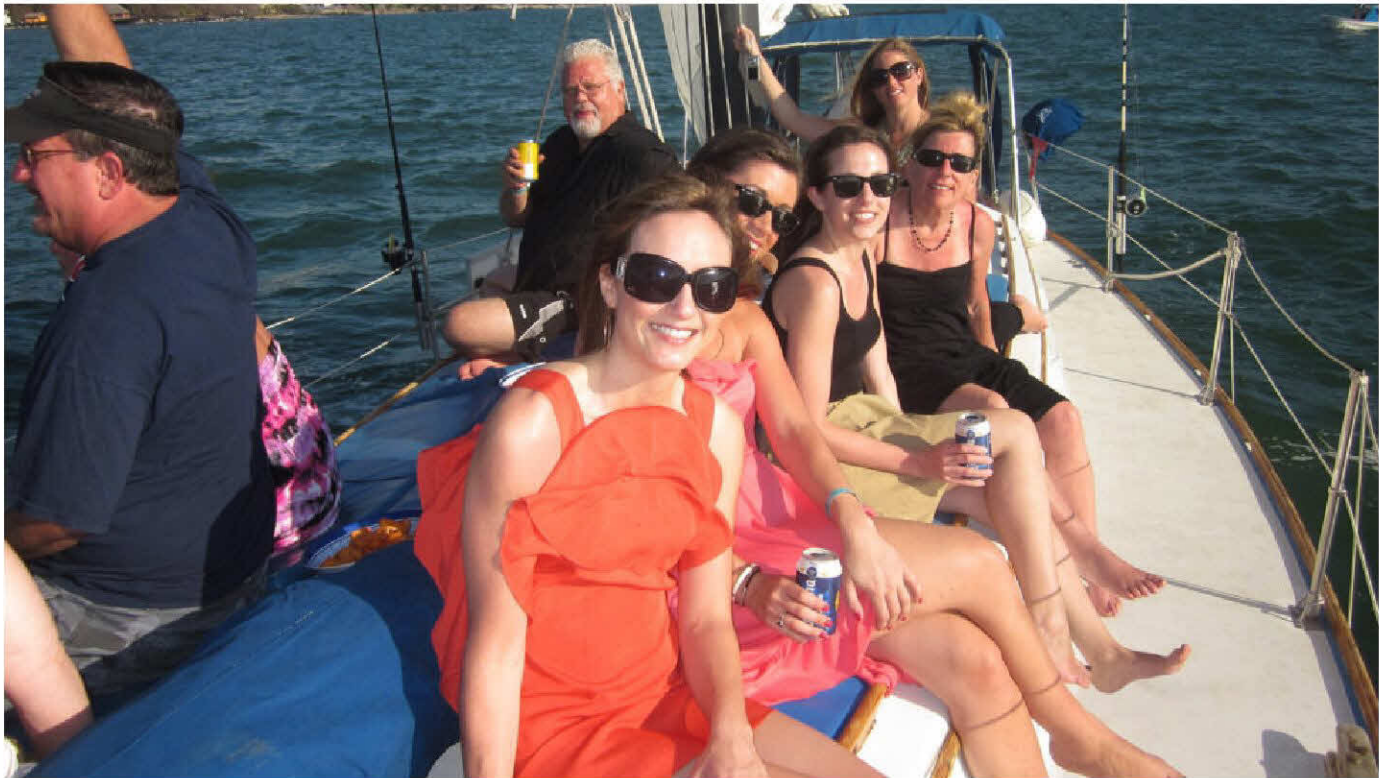
Club Med Ixtapa offers a sunset cruise, for a fee.

Club Med also offers excursions for a fee. On my friends' getaway, we took two: a relaxing sunset cruise and a snorkeling tour to nearby Ixtapa Island. With no electricity and little water, the island is a throwback in time with quaint beach cafes. With our toes in the sand, we enjoyed fresh guacamole, pico de gallo, fish tacos, cheese quesadillas and beer served in an ice bucket.