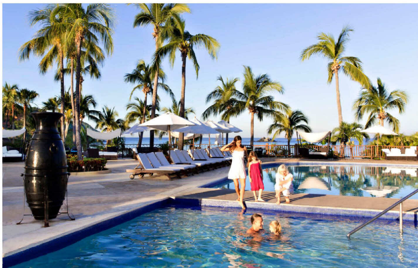
Club Med Ixtapa's idea for couples, friends or a multi-generational family vacation.

On my visit with friends to Club Med Ixtapa Pacific ( https://www.clubmed.us/r/ixtapa-pacific/ ), we were greeted cheerfully by G.Os (Gracious Organizers), who represent more than 25 nationalities at each Club Med village (there are more than 80 worldwide). G.Os are what distinguish Club Med from other all-inclusive resorts. From check in to check out, these friendly, multilingual young people interact with guests, called Great Members. With G.Os leading the way, it's easy to get in the groove of the "Club Med culture." These interactions create a close-knit environment and enhance your trip.